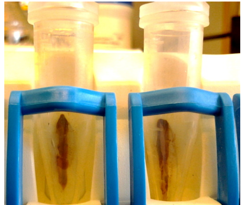
Concentrating beads on MPC after addition of Melt Solution. White capture beads fail to “uncouple”.